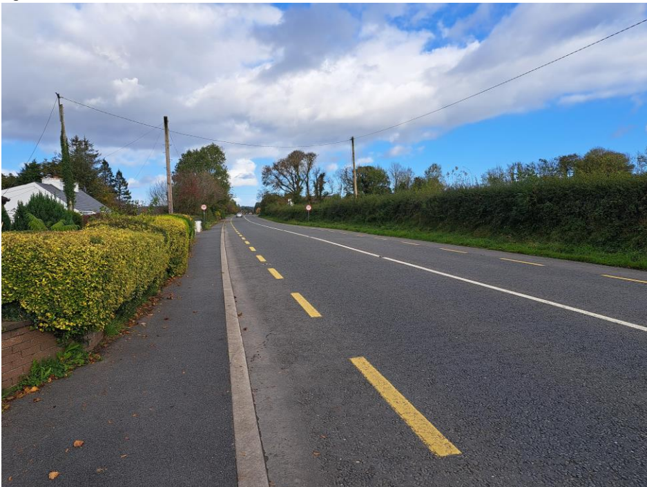
Plate 1 Looking northeast along N78 with location of proposed temporary access for abnormal loads on right

As shown in Figure 15-8, there are accesses to 2 existing residential properties on the north side of the N78 and an access to a public house on the southeast corner of the N78 / L-1834 junction. It is noted that these accesses will not be impacted by the proposed temporary link road.